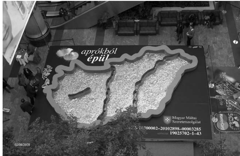
MMSz's year-long charity campaign, collecting 1 and 2 forint coins

♥ The “ Béres Alapítvány ” (Béres Foundation) donated again this year to the MMSz 10,000 vials of its immune system fortifying product, which was distributed to those who needed it most, in 7 of our regional organizations.