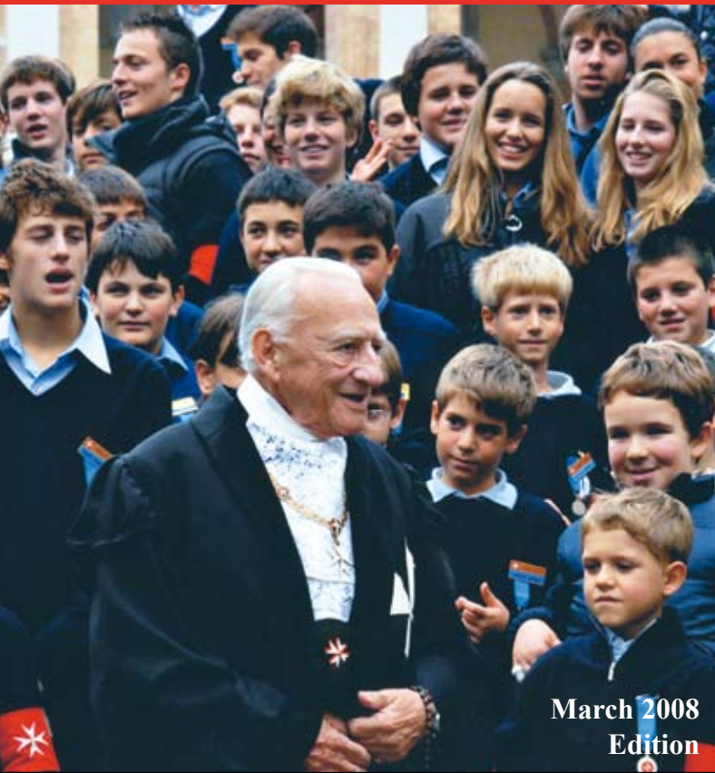
March 2008 Edition