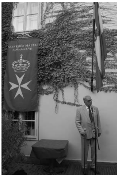
The Association President speaking at our August 19th reception

In the evening began the Saint Stephen's Day reception, which was honored by the attendance of His Eminence Cardinal