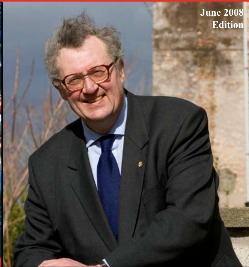
June 2008 Edition