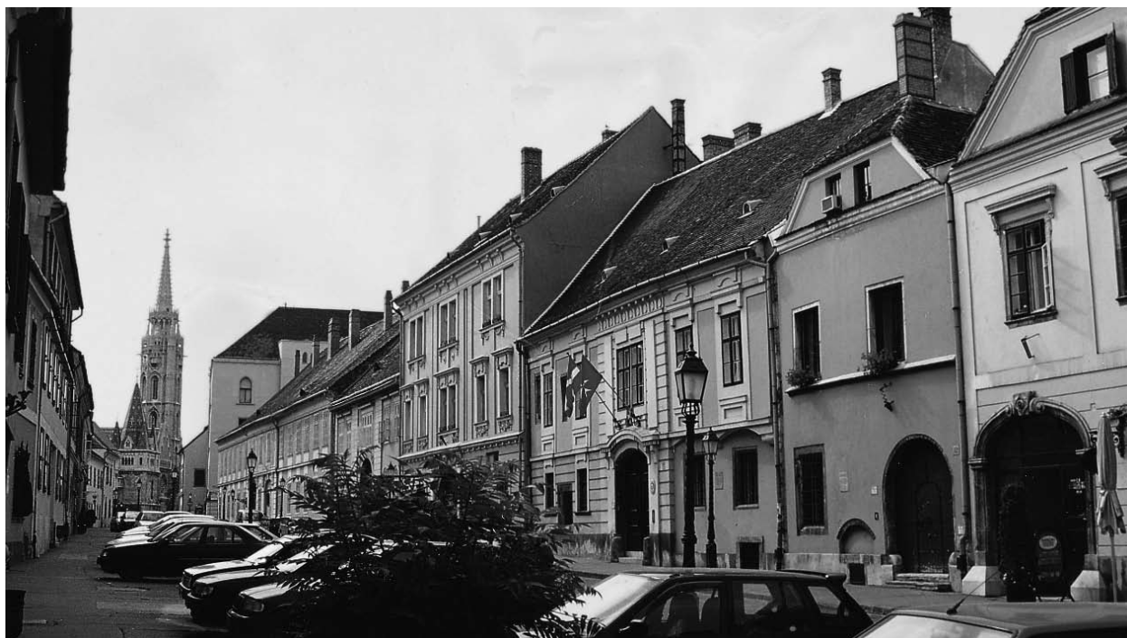
The facade of the Order's headquarter building in the Buda Castle