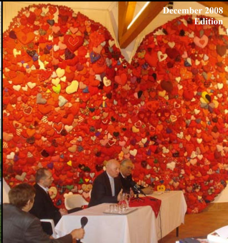
December 2008 Edition