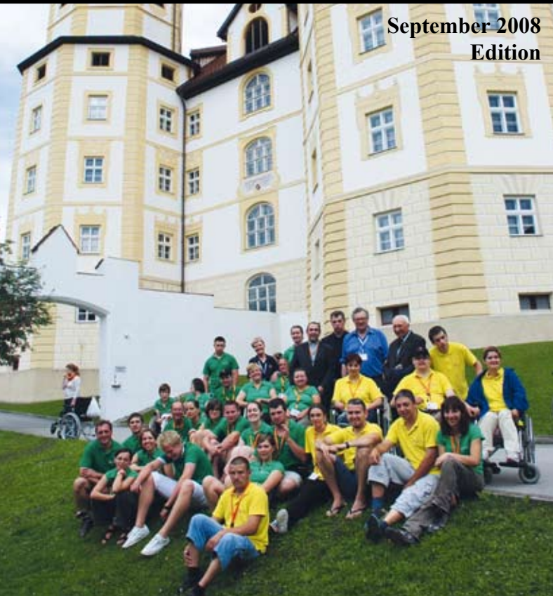
September 2008 Edition