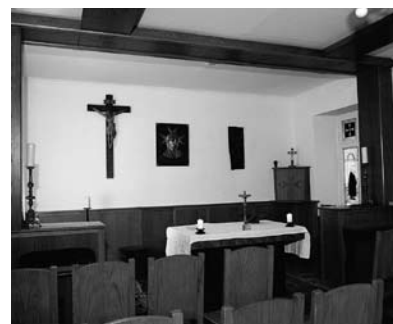
The Chapel in the Order's Building

The renovation work did not stop here. In 1999 the Order's chapel was completed on the first floor of the main office building. The chapel was consecrated on September 8 on the day of Our Lady of Philermo by His Excellency Primate Cardinal László Paskai, Archbishop of Eger. It was at this event that the