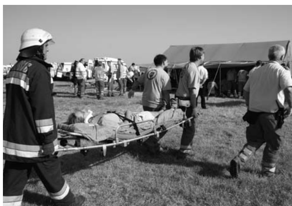
Emergency drills organized by MMSz in Sukoro