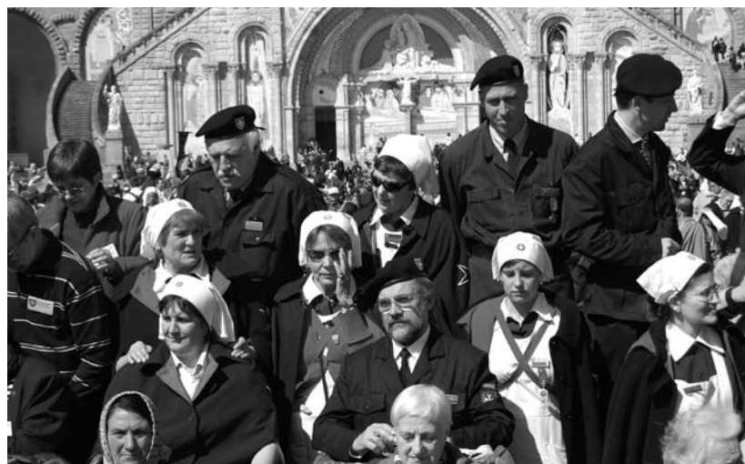
Hungarian pilgrims in Lourdes

This year's pilgrimage to Lourdes took place in wonderful spring weather from